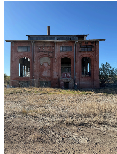
Walsen Power Plant