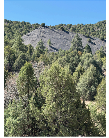
Coal Slag heap - Berwind